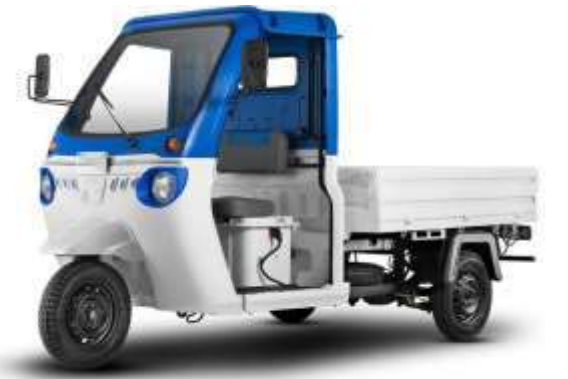
● E-Rickshaw 1 – 1.5 Kilowatts