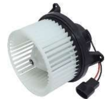
● BLDC AC blower motor 120-200 watts