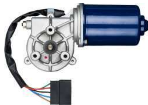
● BLDC Wiper motor 30/60/90 watts