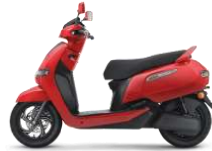
● Low speed E-scooter 1 -1.5 Kilowatts