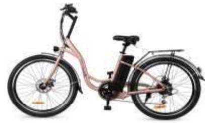
● E- cycle 250 -350 watts