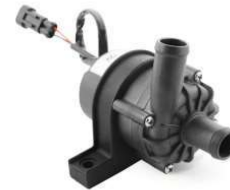
● BLDC Coolant Pump 12-30 watts