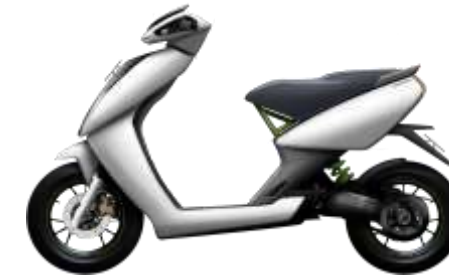
● High speed E-scooter 2.5 -3.5 Kilowatts