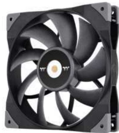
● BLDC Radiator fan 300/600/900 watts