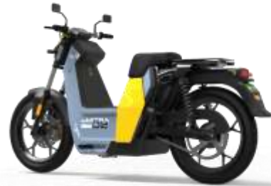
● E-moped 500 -750 watts